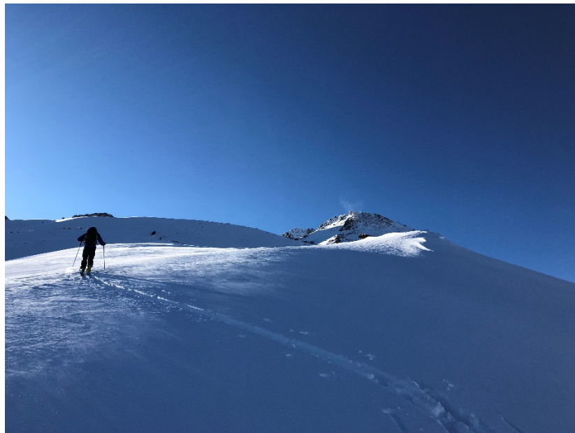
Figure 3: View of Edward Dunn skiing between camp 1 and camp 2

Extracts from Soviet Military Topographical Map (SMTM) showing camp 1 (red triangle), camp 2 (blue triangle) and final point reached (green arrow) Left hand map 1:200,000, k44 XIV, Right hand map 1:100,000 k44 051 https://kac.centralasia.kg/maps/