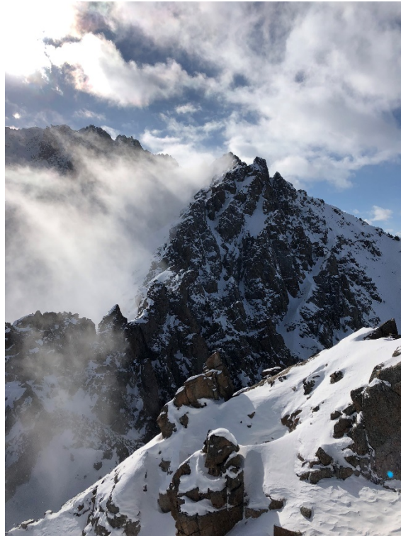
Figure 4: View of the ridge leading to the 3,941m summit from our final point

(3,941m) there was a drop of around 50-100 metres to gain a more serious looking ridge which led directly to the summit. We estimated that the ridge would take at least 6 hours to climb (from our current location, and hence ~10 hours from camp 2), and the return would not be much faster. We returned from this point to camp 2