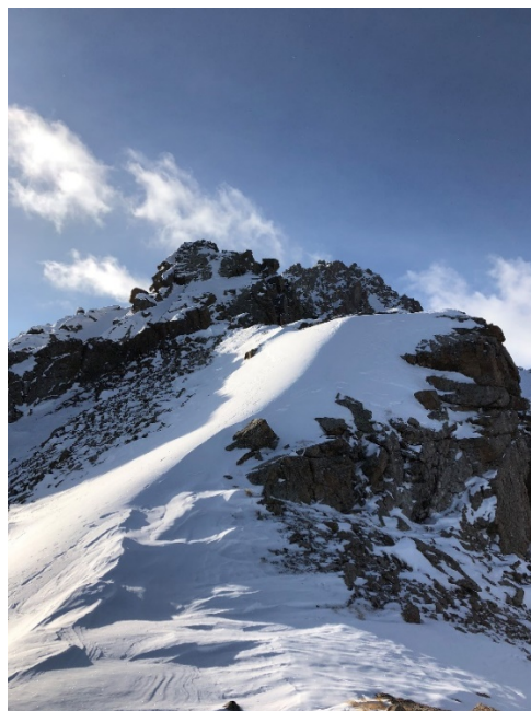
Figure 5: typical view of the ridge above camp 2

On 06 Jan we returned directly to Jygerlan from camp 2.